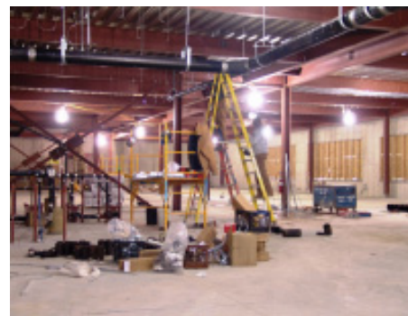
The building is totally enclosed and work is underway on the 70,000-square foot interior