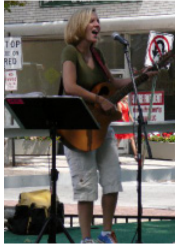
At the Hartsdale Farmers Market