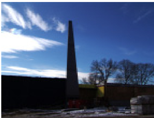
Construction Update: The tower of the new Gateway Center now rises above the campus. The building will open in 2010.

The first half of the gift will complete the $14.5 million capital campaign for The Gateway Center, and provide for