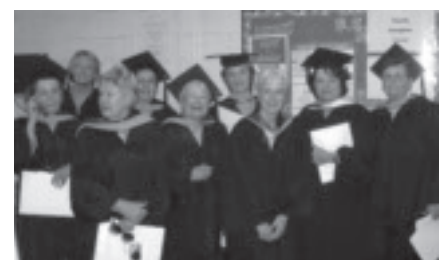
Members of the 1959 Medical/Dental class have kept in touch for fifty years

Hopefully, members of the class of 2009 will return to campus in 2059 to celebrate their fiftieth reunion!