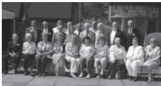
The entire group enjoys a great view of the campus from the Hartford Hall patio. How it's changed since 1959!

Twenty-four members of the Westchester Community College class of 1959 arrived at the Valhalla campus on May 21st to celebrate their fiftieth reunion. It was the largest gathering of 50-year alumni held to date, with WCC grads coming from as far away as Colorado, Illinois, and Florida.