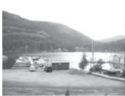
Lake Pend Oreille, Idaho