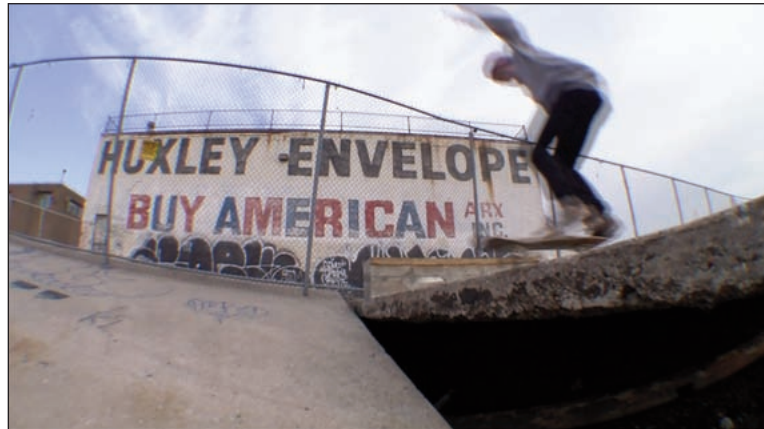
Digital Video 1

of a software package fast. The Open Studio Access Package offers facility access with technical support to community artists who wish to work on independent projects. Media rich content is available from desktop to cell phone. Personal Digital Assistants (PDA) are providing increasingly sophisticated content on the move including: music, animation, and video. This content provides both